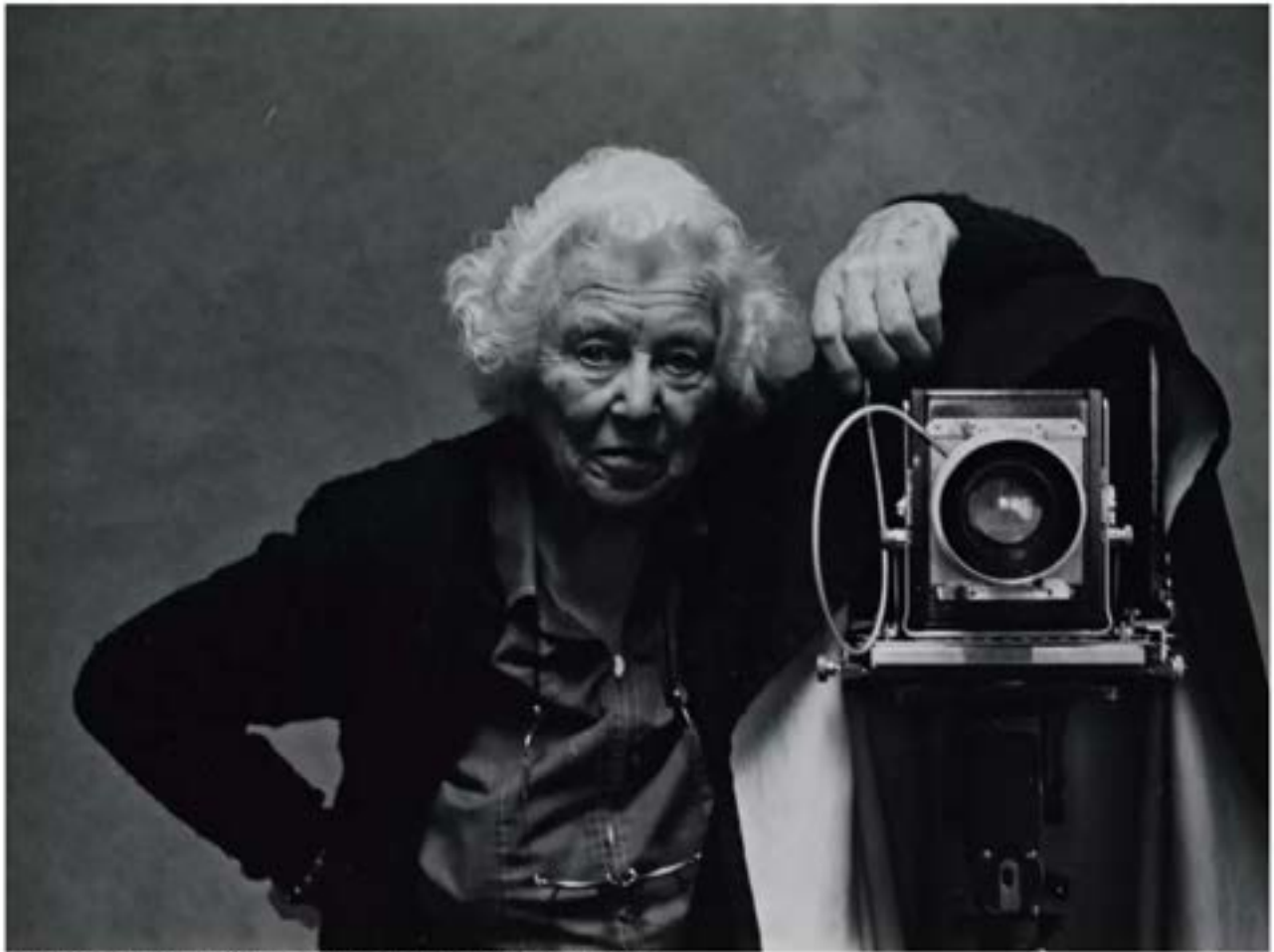
Rollie McKenna, "Laura Gilpin" (1962) at the Frances Lehman Loeb Art Center at Vassar College

Making a Life in Photography: Rollie McKenna, The Loeb