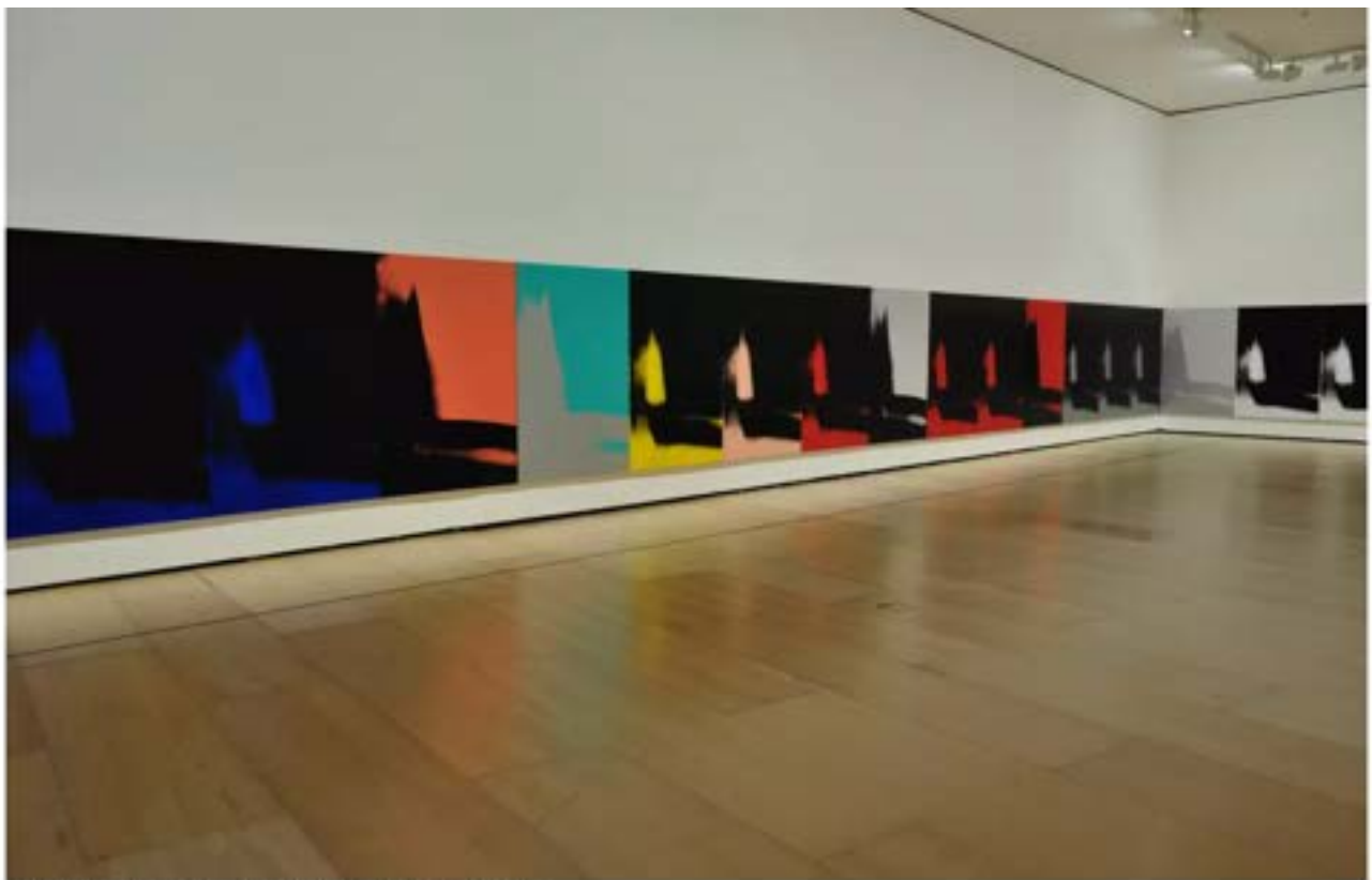
Andy Warhol, "Shadows," on display at the Guggenheim in Bilbao, Spain. Bernard Blane

Originally commissioned by the Dia Art Foundation in the late 1970s, Andy Warhol's "Shadows" is a single painting made with video stills that are laterally concatenated around a room. Now on long-term view, the installation unionizes the dualities in Warhol's practice: the moving image meets the still, abstraction tangoes with representation, and reproduction falls face-first into singularity.